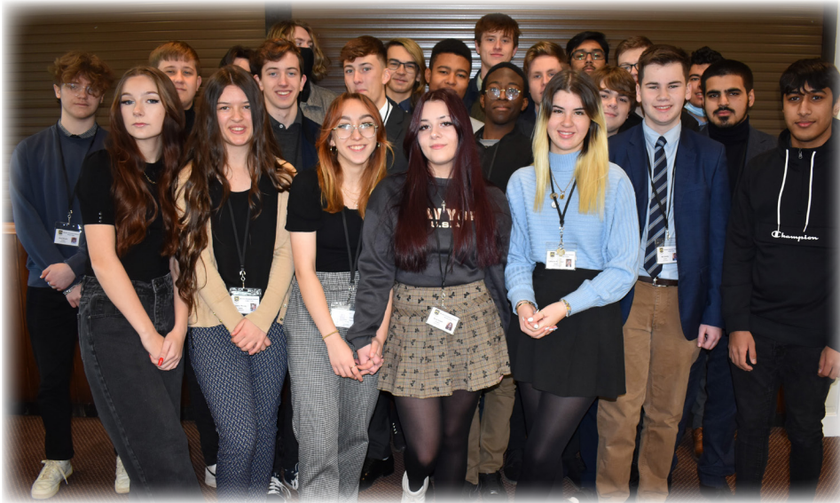
Sixth form ambassadors

“During sixth form the staff are all there to help you achieve the best you can do. There is very much a family feel to the sixth form and everyone is happy to help anyone “ (Year 13 student)